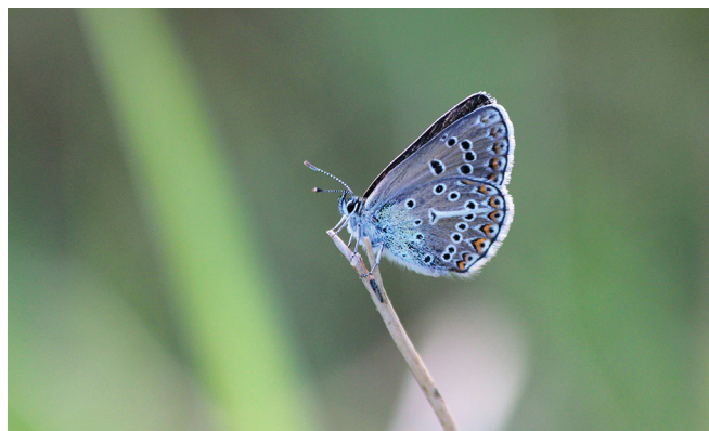
The Geranium Argus (Aricia eumedon). Butterflies can be a sign of diversity.

Biological diversity does not give a rich and colourful variety of interesting species and ecosystems for the sake only of enjoying life on Earth. Biodiversity is also what characterizes healthily functioning ecosystems – and these ecosystems are nothing less than life-support systems. Without biodiversity, vital 'ecosystem services' (explored more in the next section) are lost, denying humans their numerous crucial benefits, from food and medicines to recreation and renewal.