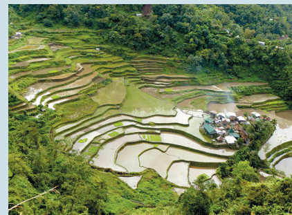
Forest above rice terraces guarantees continuous water supply and high biodiversity. The village pictured among the terraces here is Banga'an, in a UNESCO world heritage site in the Philippines.

If land is managed sustainably, ecosystems can be flexible enough to meet the changing demands of societies. Sustainable use of ecosystems, including agricultural production systems, can help with mitigating or adapting to climatic, environmental and socioeconomic changes.