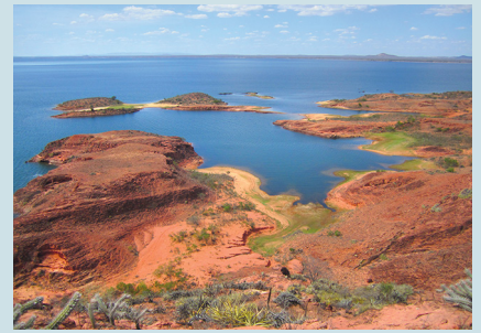
Itaparica reservoir seen from Petrolândia town.

Two of the projects with particular relevance to sustainable water management have been highlighted in this policy brief (see the Research insights: INNOVATE and LEGATO). Many more examples concerning irrigated agriculture – which accounts for over two-thirds of the world's water withdrawal – will need to follow these sorts of lessons for tackling water scarcity. Water scarcity is not an isolated challenge; severe expansion of soil salinization also results from overirrigation. Various water interests, not just agriculture, are in conflict, too, including industrial and domestic ones such as hydropower generation.