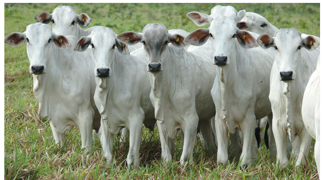
Nelore cattle, pictured here in an Amazon region of Brazil, are well adapted to tropical climates. But to make way for cattle – and for soya, maize and cotton crops – rainforests have been cleared and the timber sold, degrading a vital forest for carbon-capture and storage.

Long-term investment is needed to counter greenhouse gas emissions, causes of which include the following land-management factors: