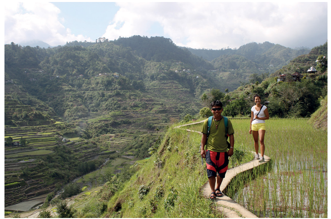
Ecosystem services include ecotourism, pictured here in the Philippines.

Improving soil organic matter and carbon content improves soil fertility, soil biodiversity, water-holding capacity and carbon