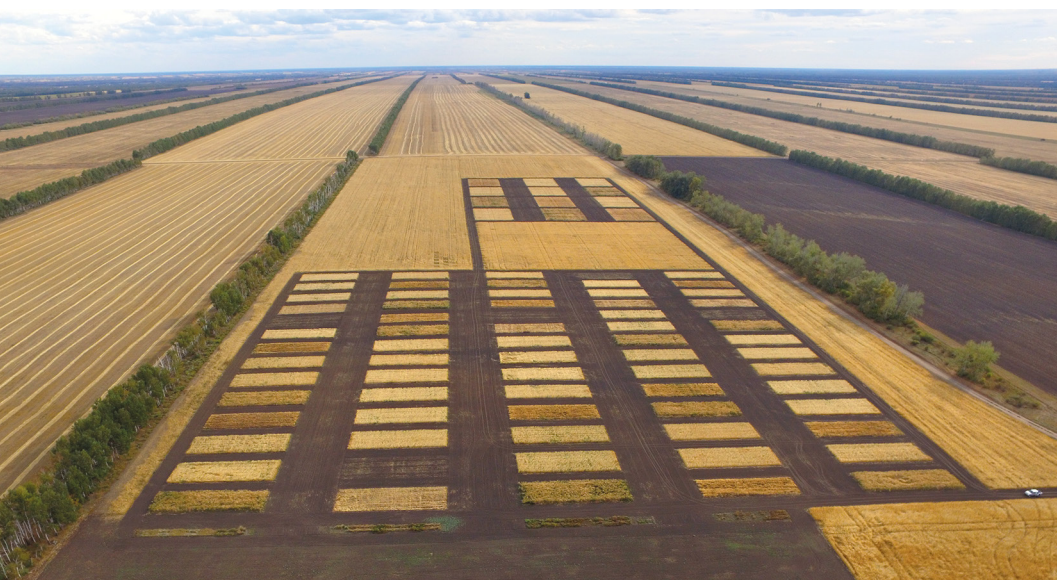
Experimental field sites in Western Siberia. See Research insight: KULUNDA.

Making the scientific understanding of sustainable land management usable in the field, this scientific synthesis project, GLUES, coordinated by the Helmholtz Centre for Environmental Research – UFZ, was part of a research programme on SLM funded by Germany’s Federal Ministry of Education and Research – BMBF. The insights here will enable policymakers and others to support SLM as a vital contribution to global problems. Now more than ever, lessons about the interactions between land use and socioeconomic, cultural, environmental and climate factors are of crucial importance.