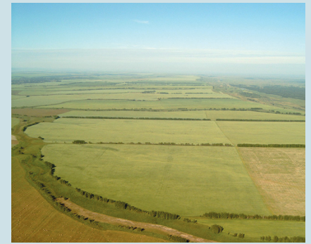
West-Siberian agriculture: vast plains of land are vulnerable to wind erosion.